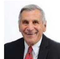
Coach Jim Harrick Former Basketball Head Coach, UCLA, Pepperdine, University of Rhode Island, University of Georgia