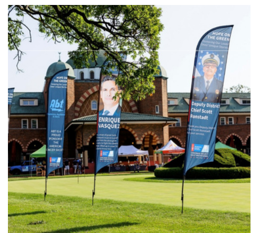
Hope on the Green Fly Flags